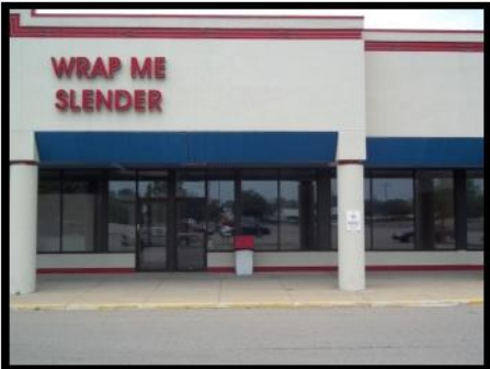
Available Space - Exterior