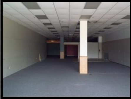
Available Space - Interior