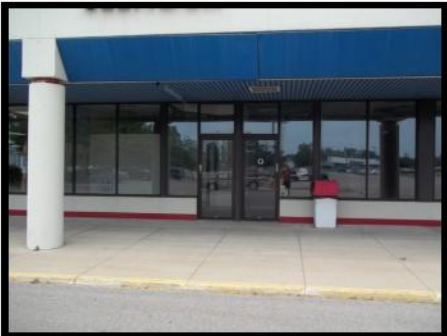
Available Space - Exterior