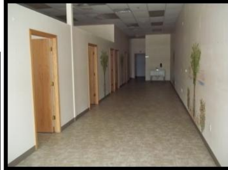
Available Space - Interior