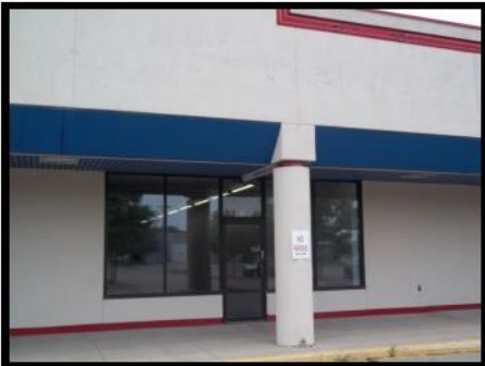
Available Space - Exterior