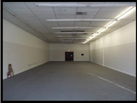
Available Space - Interior