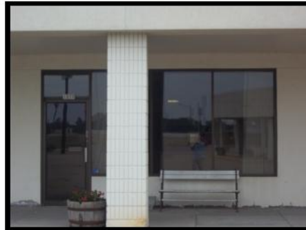
Available Space - Exterior