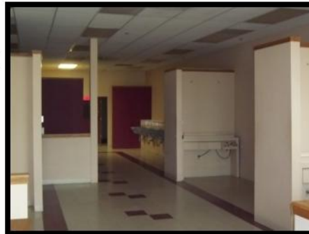
Available Space - Interior