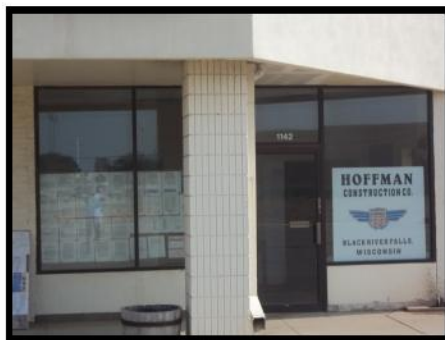
Available Space - Exterior