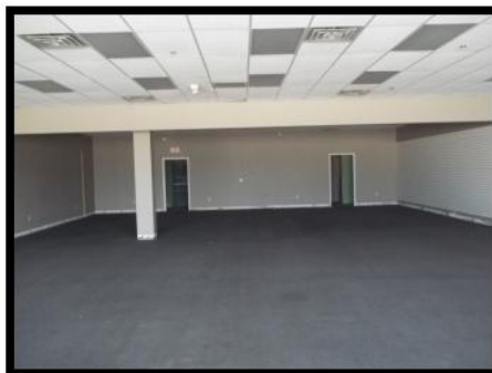
Available Space - Interior

The Koeller Center is located on the main retail frontage road to US Hwy 41 on Oshkosh's West side. Anchored by Staples and Hobby Lobby and adjacent to Walgreens this is a #1 Oshkosh retail location. Available spaces range from 1,000 sq.ft. to 12,000 sq.ft. (if spaces are combined).