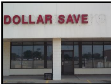
Available Space - Exterior