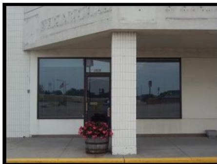
Available Space - Exterior