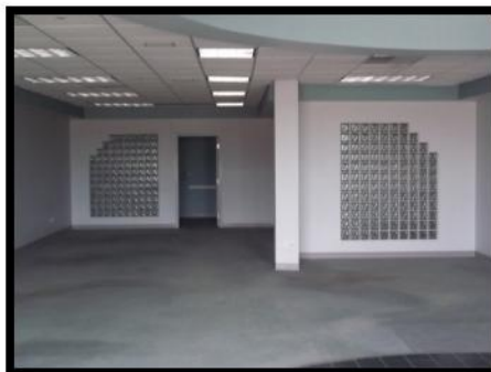
Available Space - Interior

The Koeller Center is located on the main retail frontage road to US Hwy 41 on Oshkosh's West side. Anchored by Staples and Hobby Lobby and adjacent to Walgreens this is a #1 Oshkosh retail location. Available spaces range from 1,000 sq.ft. to 12,000 sq.ft. (if spaces are combined).